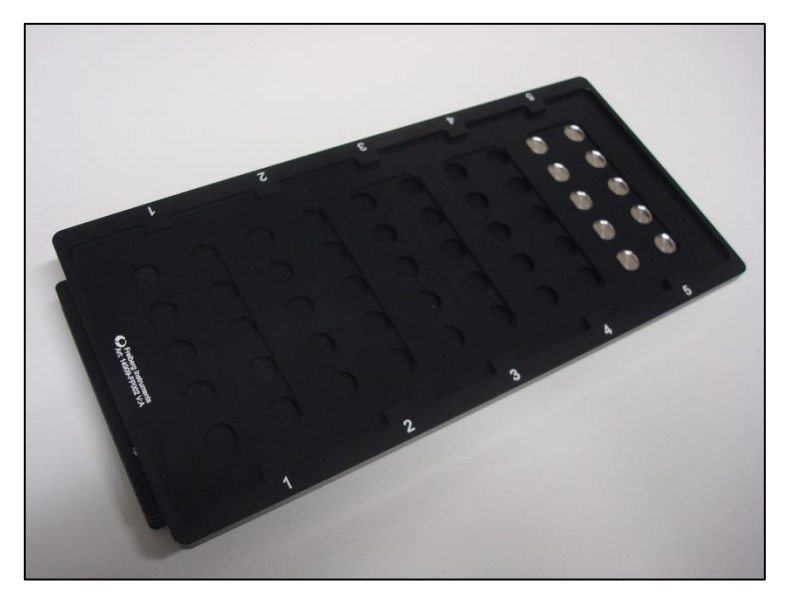
Figure 4: Sample cups added to the Aliquot Storage Trays

Step 3: Place the suitable sample cups on the Aliquot Storage Trays for Silicon Oil Stamping and then place the Template for Silicon Oil Stamping on top of the Aliquot Storage Tray as shown in Figure 4.