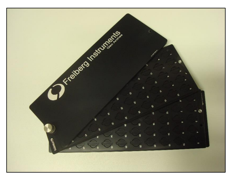
Figure 2: Aliquot storage

Step 1: Open the screws on both ends of the Aliquot Storage stack to reveal the Aliquot Storage Trays (Figure 2).