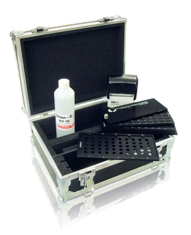
Figure 1: Aliquot Preparation Kit

The Aliquot Preparation Kit (Figure 1) contains the following components: